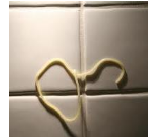
Spaghetti not sticking !

It has been proven time and time again that a “one time” training approach does not last. The first problem is that only some of the information transmitted actually “sticks”.